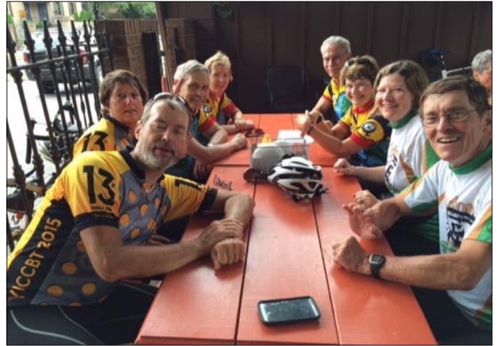
Happy riders eagerly await their orders at Plank's Bier Garten.