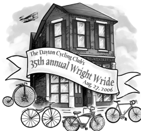
Wright Wride T-shirt design

We hope you and your friends will choose the "Wright" way to end your summer and join us for some or all of Wright Wride Weekend. The informational flier/ application form is available at www.daytoncyclingclub.org , in the "Rides" section. Or contact me and I will mail you the brochure.