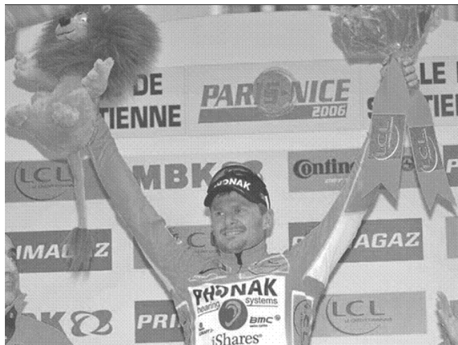
All hail Floyd Landis, winner of the first post-Lance era Tour de France.

There are approximately one thousand cycling fatalities in the U.S. each year, according to the Consumer Product Safety Commission.